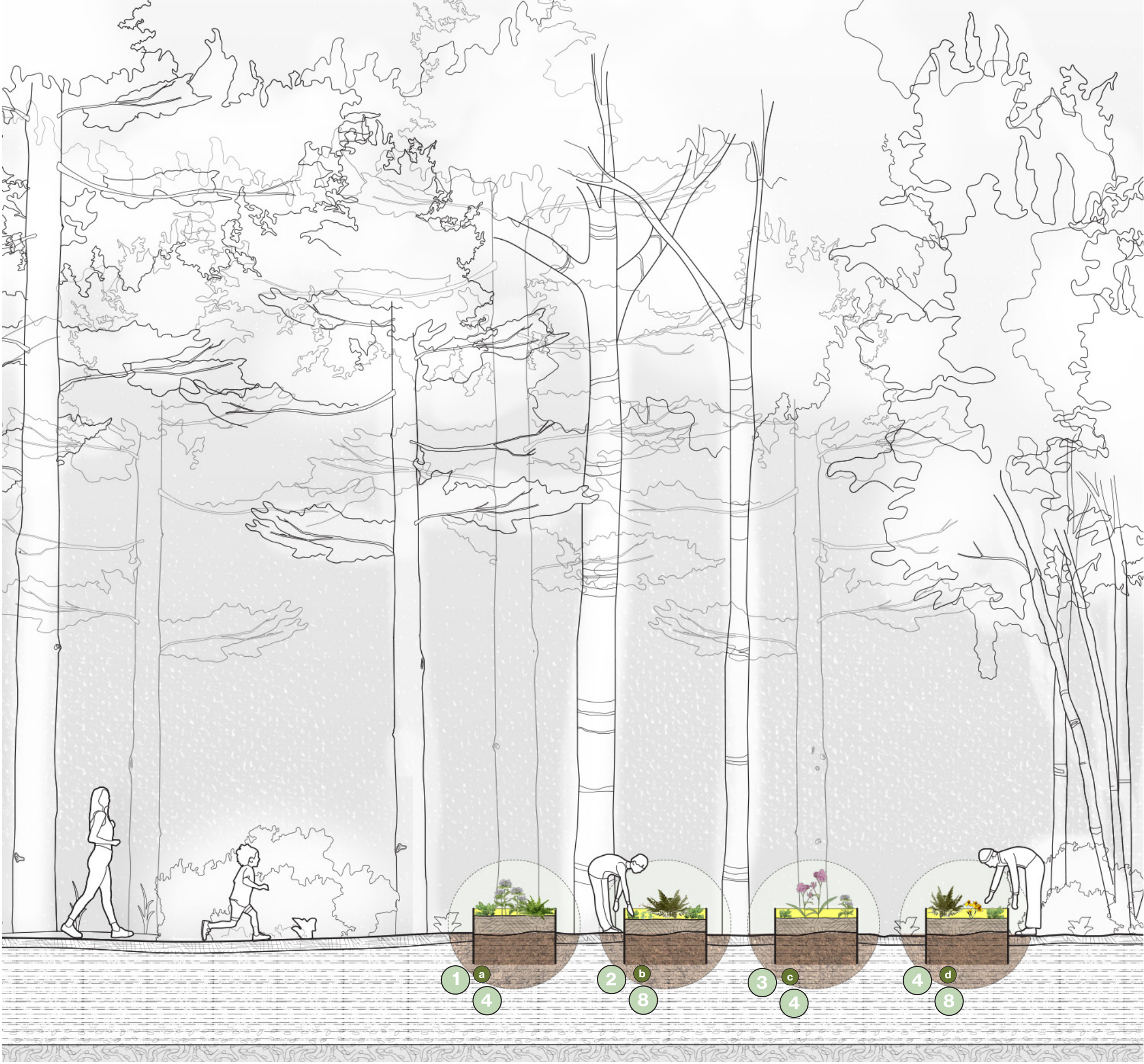
Section, Summer Showing the scale of the planting beds and their relationship to native material on-site