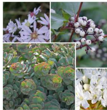
Up_Quebec Heart-Leaved Aster, Red osie