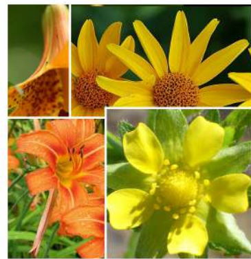
Up_Canada lily, heliopsis, ditch lily, Potentilla