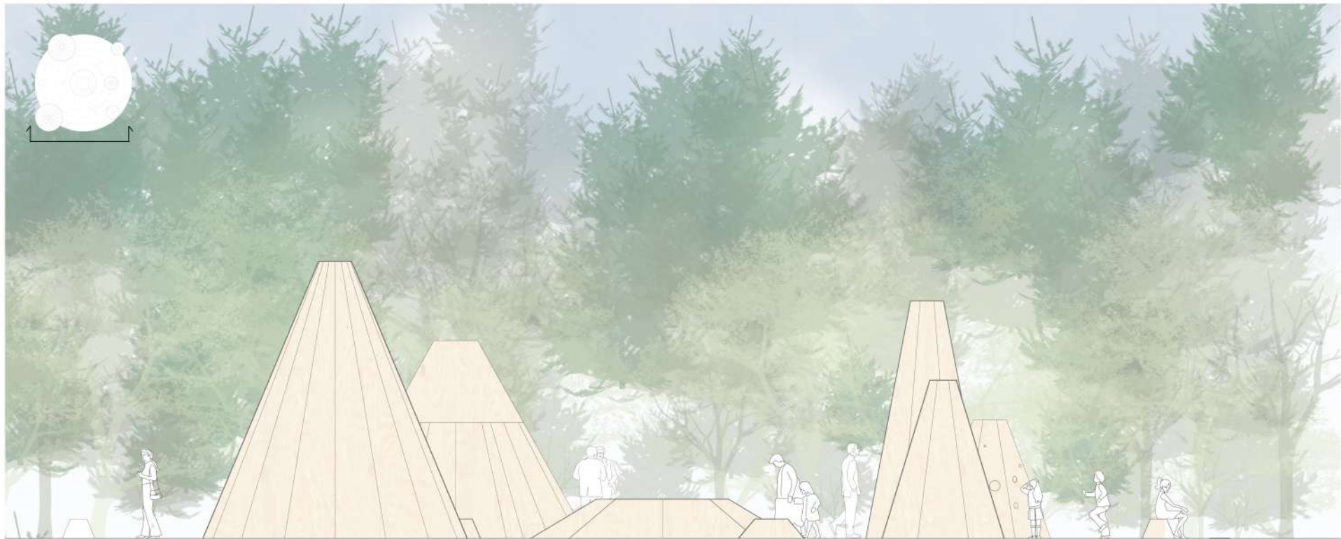
Prospect A scale 1:100