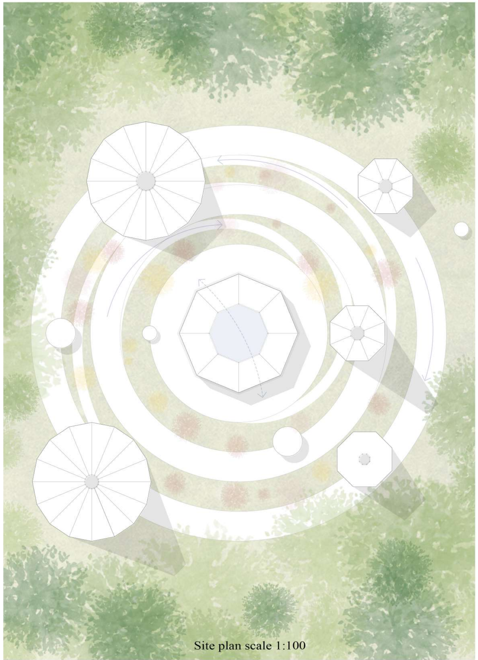
Site plan scale 1:100

In addition to these proposed plants I think it is essential to preserve native plants .