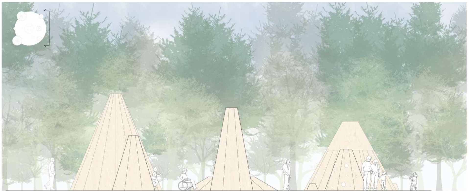
Prospect B scale 1:100