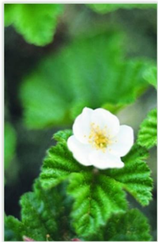
Rubus chamaemorus L