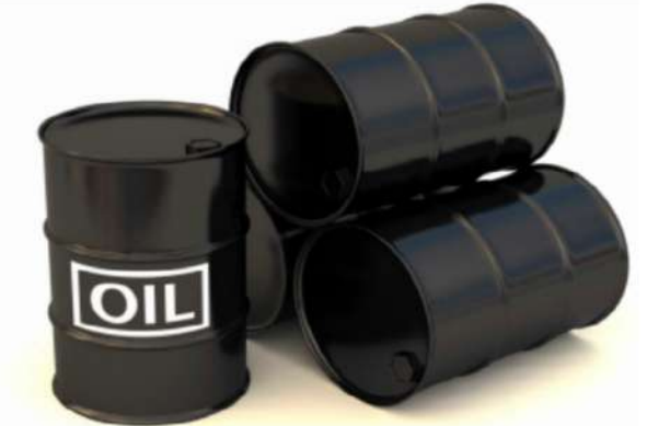
Oil drums as pots