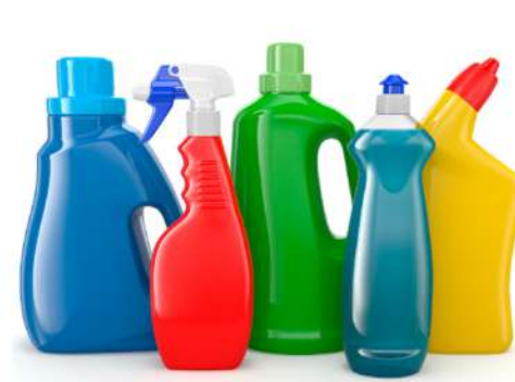
Recycled plastics in containment

The metaphorical dialogue is accentuated by vegetation, materials, color, forms, and use with the hope that today more than ever the visitor will remember: change is inevitable but transformation is a choice.