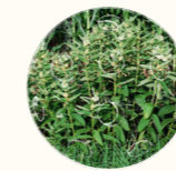
ASCLEPIAS SYRIACA VENEZUELA