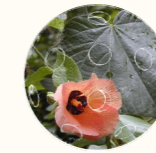
HIBISCUS TILIACEUS TUVALU