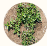
PORTULACA OLERACEA SUDAN