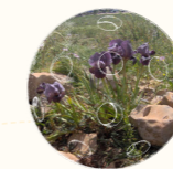
IRIS HAYNEI GAZA