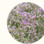
STATICE LATIFOLIA UKRAINE