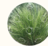
STIPA CAPILLATA UKRAINE