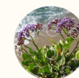
ARTEMISIA TAURICA UKRAINE