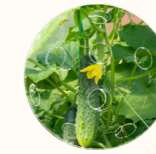
CUCUMIS ANGURIA SUDAN