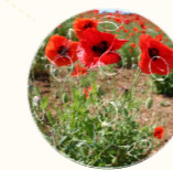
PAPAVER RHOEAS GAZA