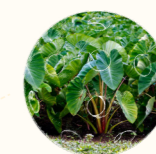
COLOCASIA ESCULENTA TUVALU