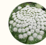
DAUCUS CAROTA COLOMBIA