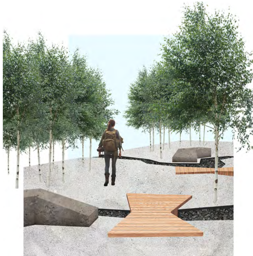
Laminated wood bridges provide three moments of crossing over the charcoal seam.