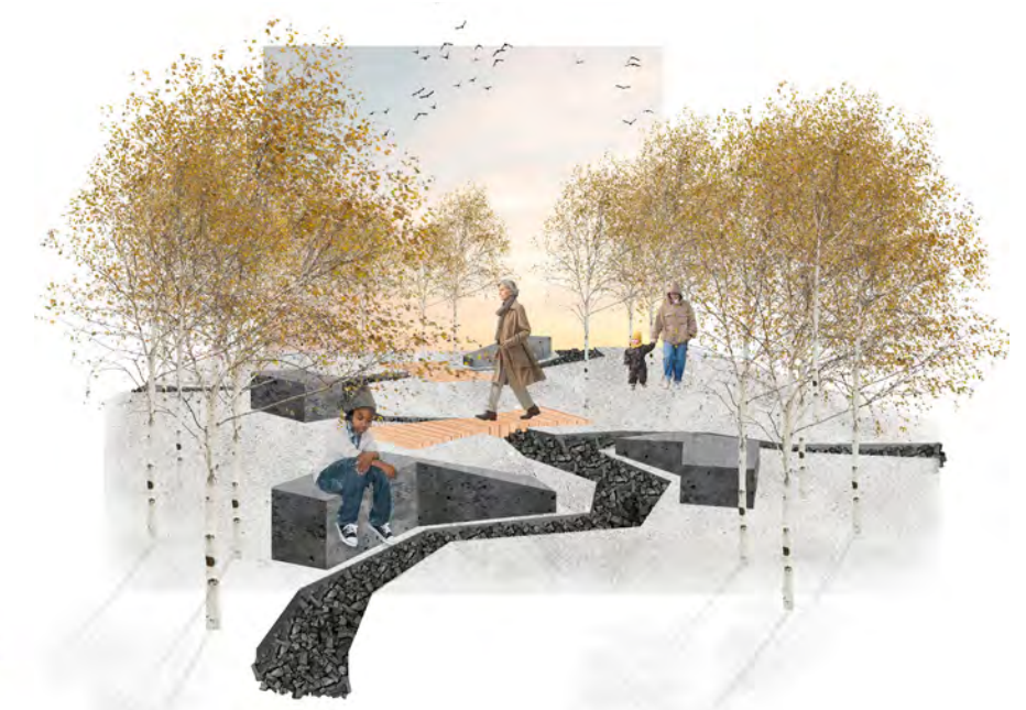
Textured concrete fragments provide varied seating opportunities beneath the grove of birch trees.