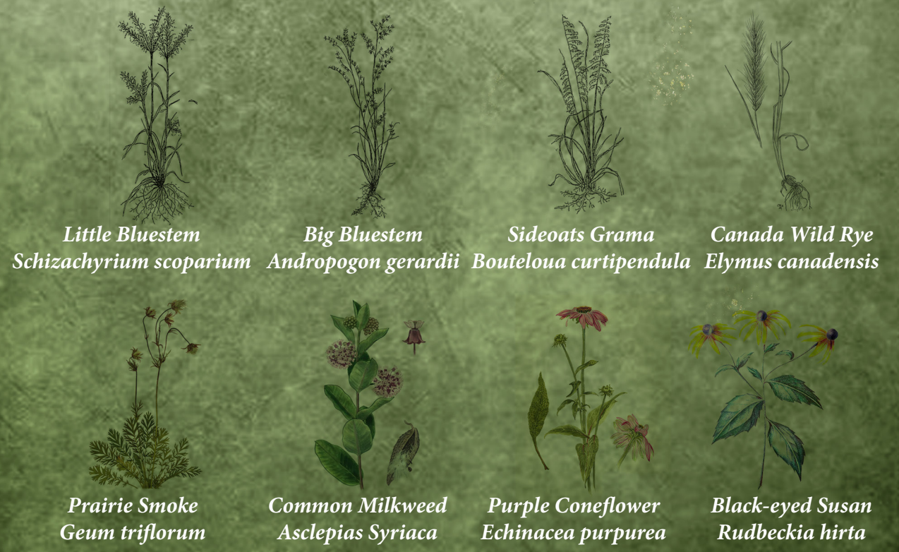
Little Bluestem Schizachyrium scoparium Big Bluestem Andropogon gerardii Sideoats Grama Bouteloua curtipendula Canada Wild Rye Elymus canadensis Prairie Smoke Geum triflorum Common Milkweed Asclepias Syriaca Purple Coneflower Echinacea purpurea Black-eyed Susan Rudbeckia hirta

At each opposite end of the wound stands a tall monolithic post, designed to evoke early surveying tools. Here, visitors can peer through a narrow opening, providing a confined view of the landscape, contrasting sharply with the expansive vistas typically experienced when surrounded by nature. This duality encourages reflection on how we perceive and interact with our world, prompting questions about the borders we create—both literal and metaphorical—and their lasting impact on the planet.