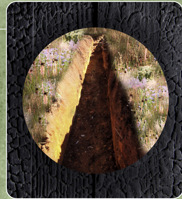
View through small opening provides a moment of reflection for visitors as they witness the wound on the landscape