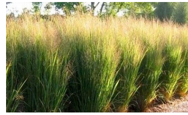
Switch grass Panicum virgatum 'Northwind'