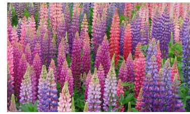
Bigleaf Lupin (Red and blue) Lupinus polyphyllus