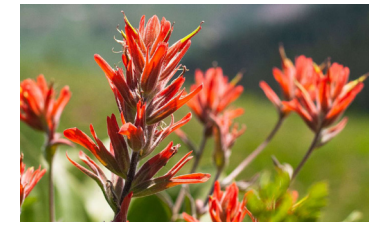
Indian Paintbrush Castilleja coccinea