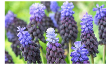
Grape Hyacinth Muscari latifolium