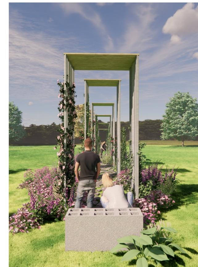
Watching angle - Front View.