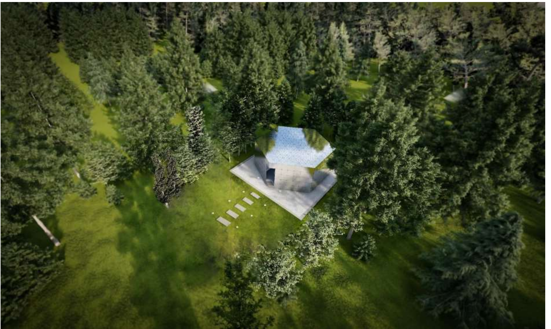
Global Map of Noah's Garden No. III