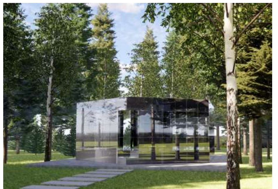
Noah's Garden No. III Full View Perspective