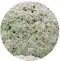
Sedum 'Bundle of Joy'