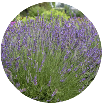
Lavandula x intermedia