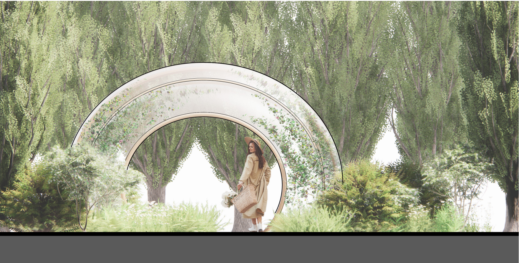
ELEVATION B-B M1:50