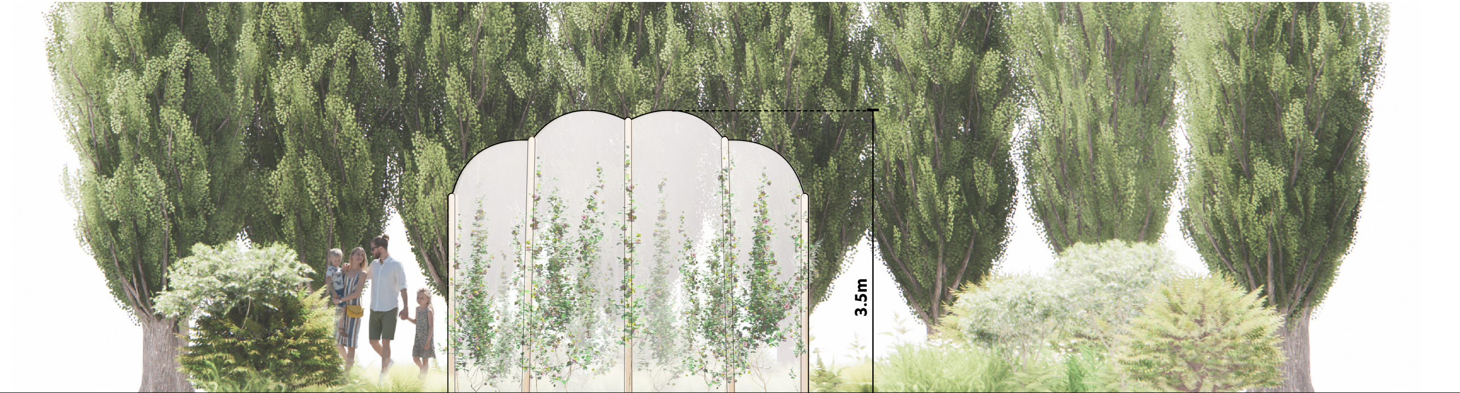
ELEVATION A-A M1:50