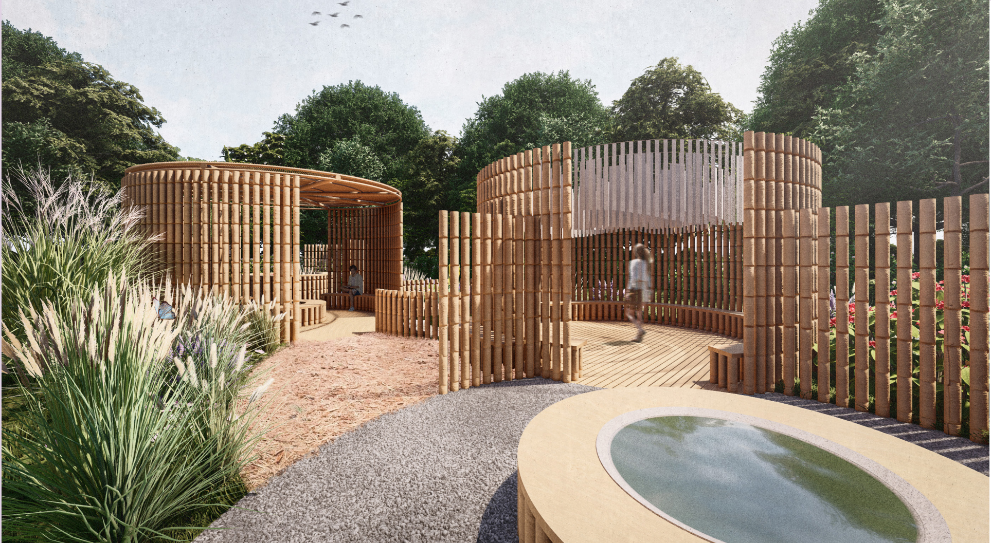
Pavilion Front Entrance