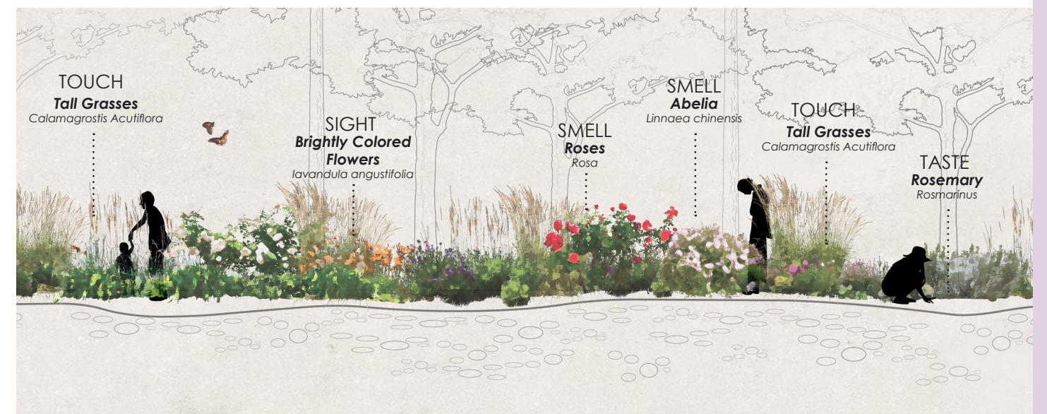
Plant Materiality and Experience