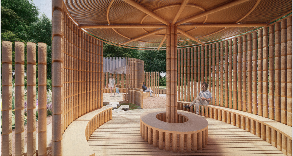
Interior Canopy View