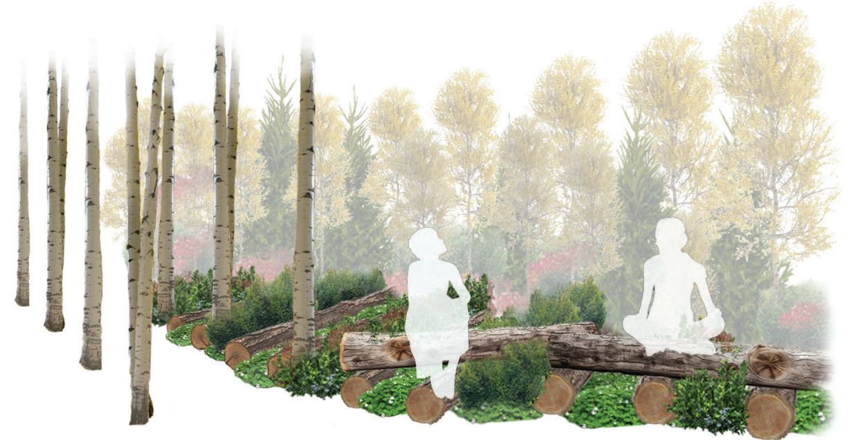
Central space for rest and reflection