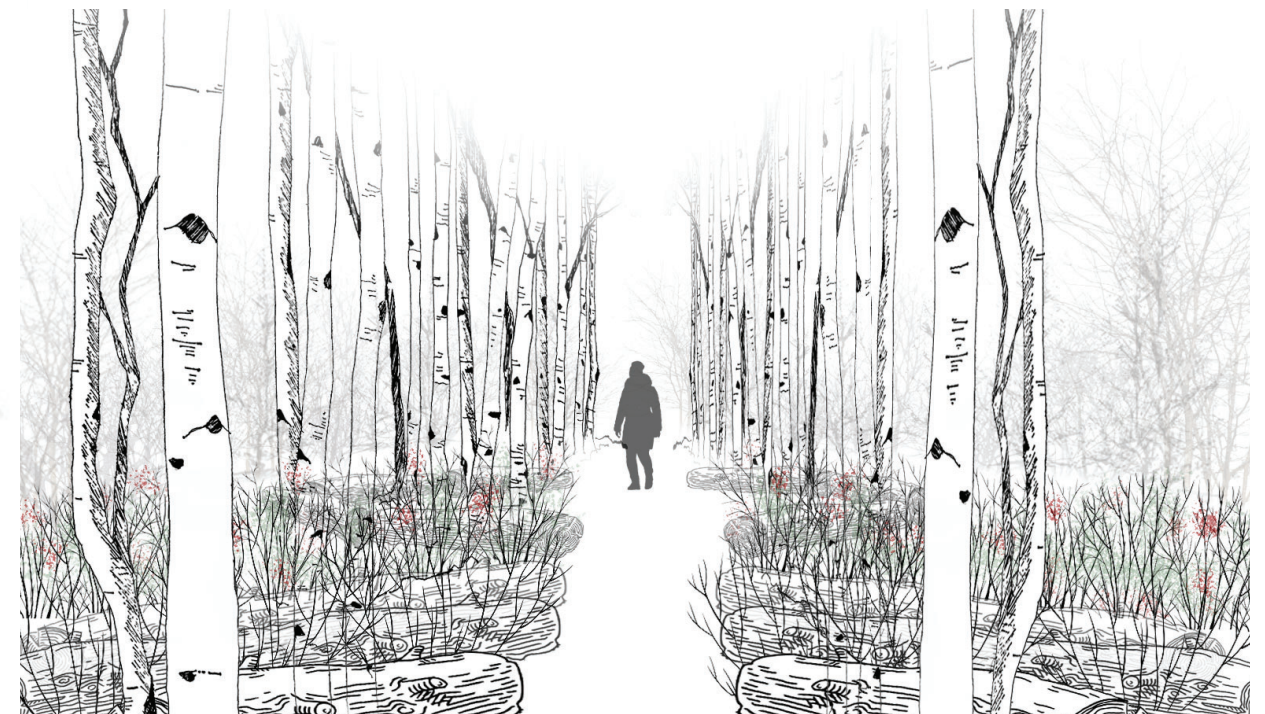
Use of timber and evergreen species for Winter enjoyment