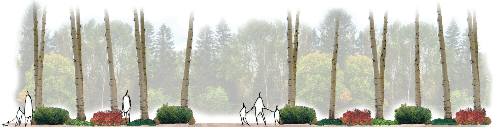
Section-Elevation B–B' (1:100)