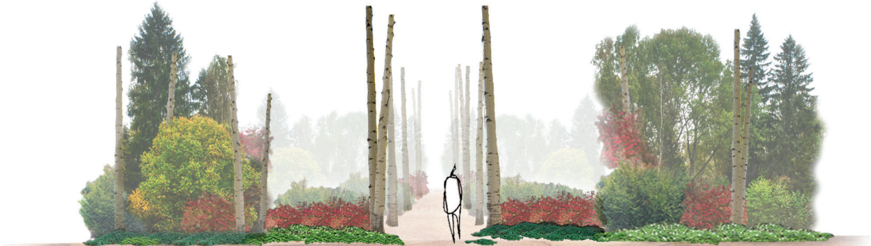
Section-Perspective A–A' (1:100)