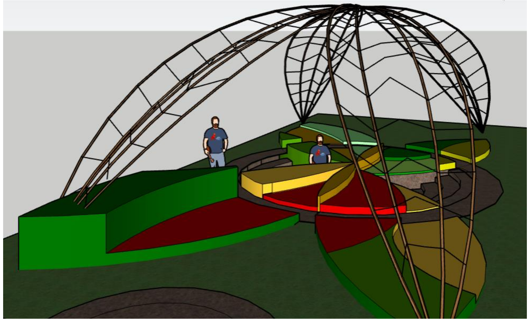
Perspective showing the entrance to the garden