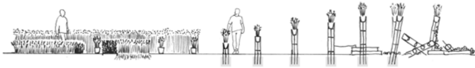
SECTION A - A' 1:100