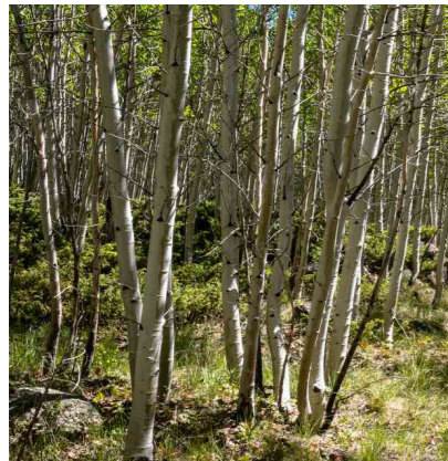
Existing Poplar forest