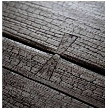
Poplar wood Yaki-sugi