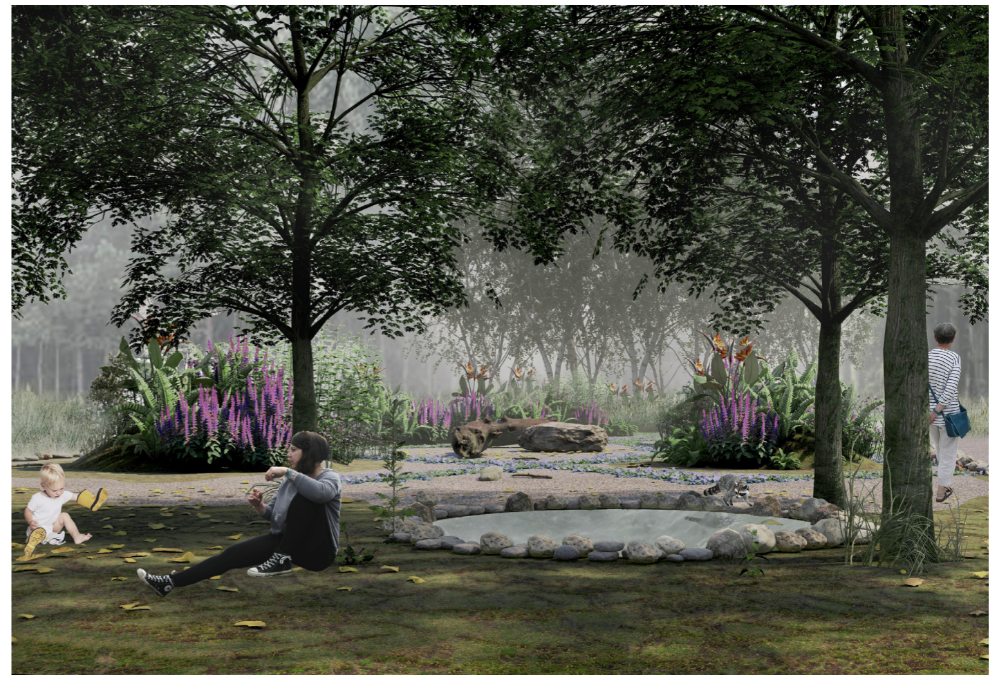
View of the entire garden from ponds in a foggy morning