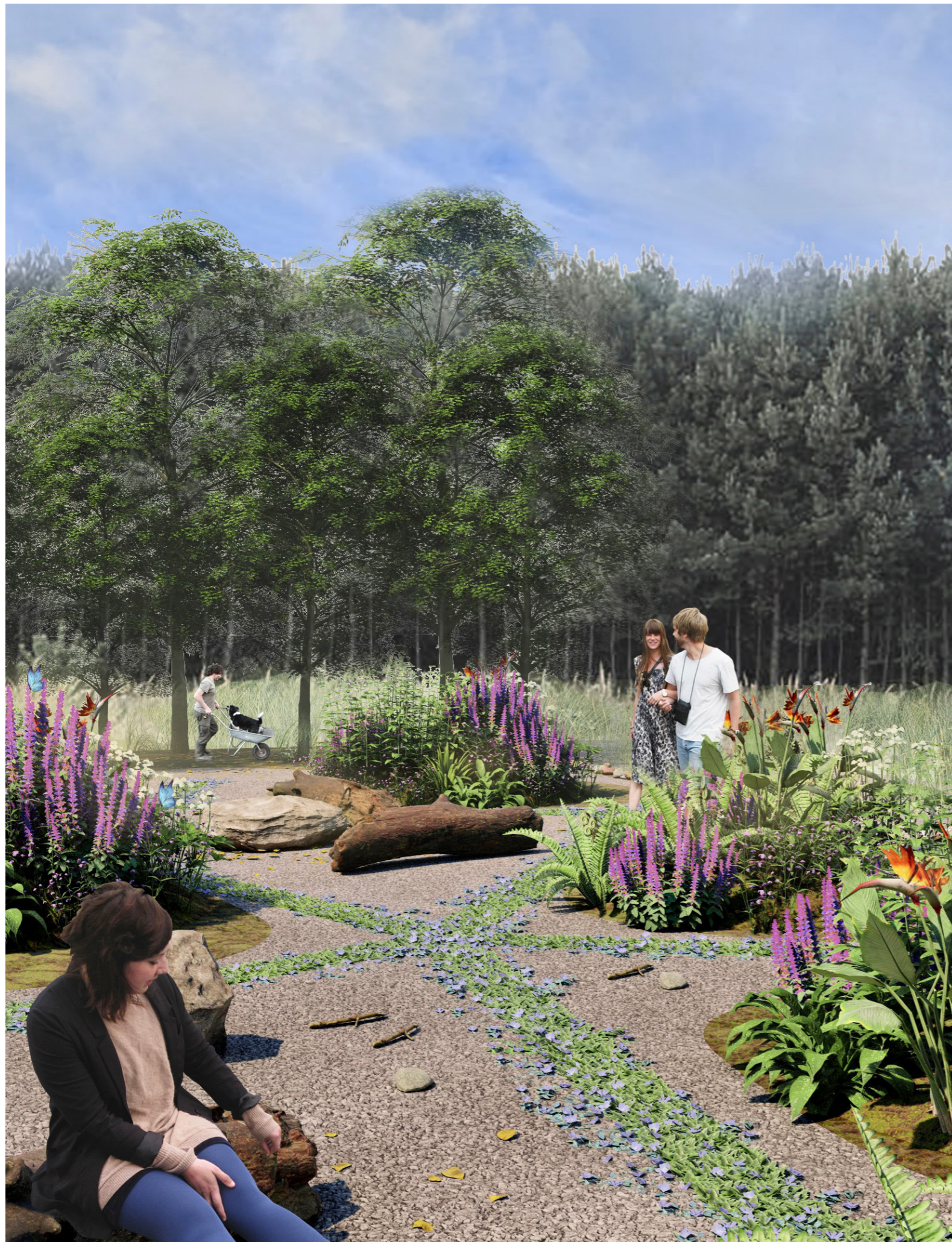
View of temporary garden from the meeting spaces at noon