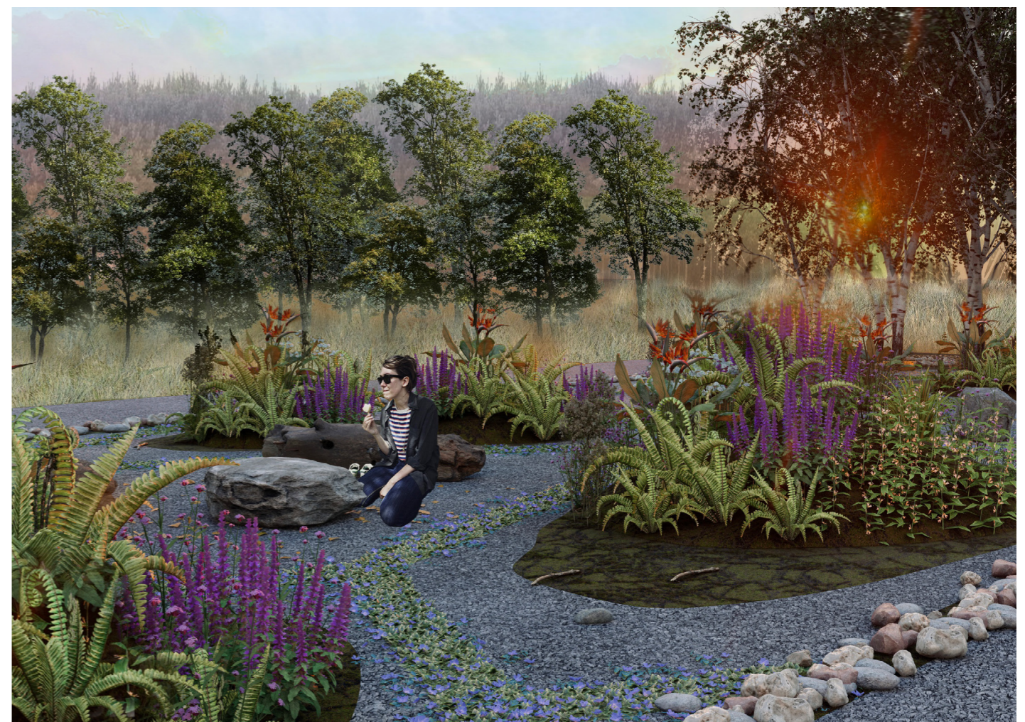
View of the meeting spaces from path of Jardins de Métis at dusk