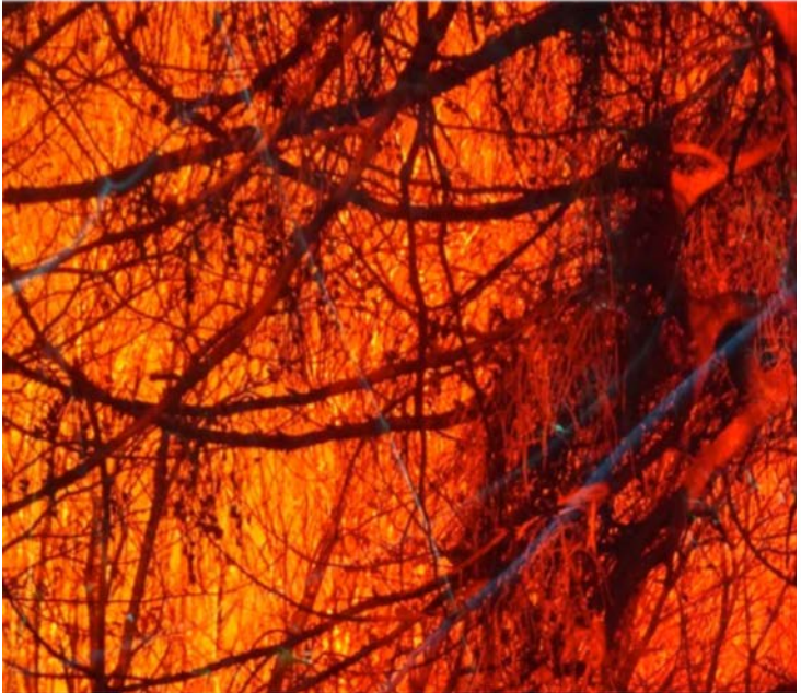
Perspective: garden entrance